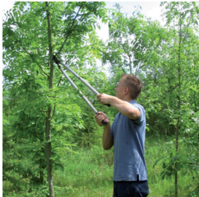
Hands on woodland management experience for students from Brooksby Melton College in Leicestershire.