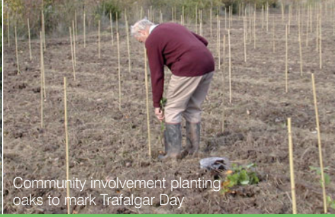
Community involvement planting oaks to mark Trafalgar Day